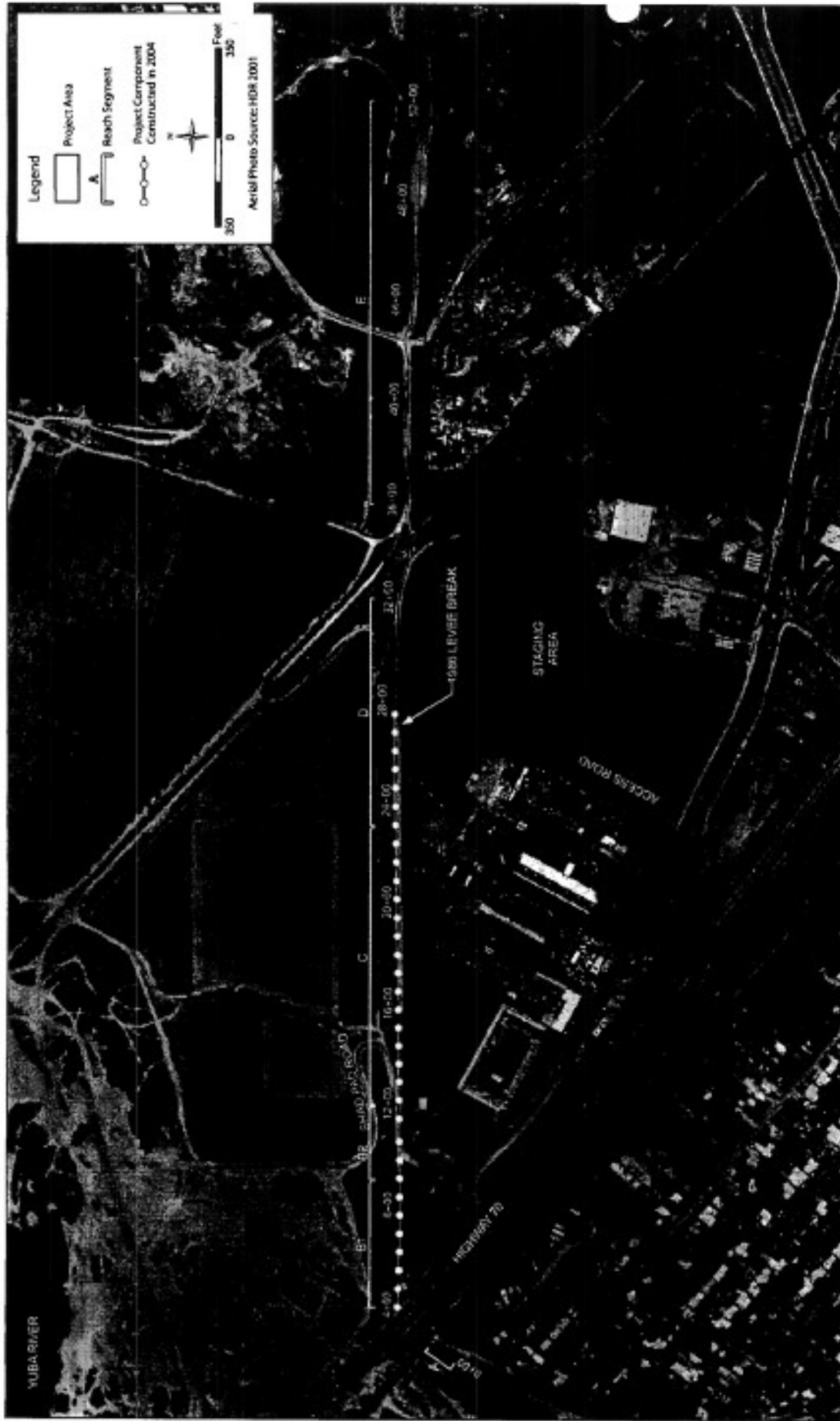
Figure 1 Project Components