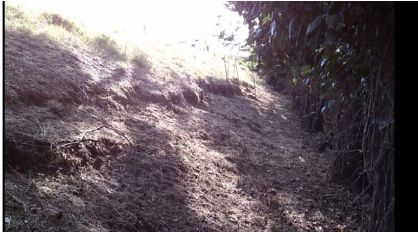
Scar at Levee Toe – South Embankment Yuba River by Shadpad Rd.

to 9+00). There is a 12 inch vertical scar at the bottom of the levee slope. See photographs below.