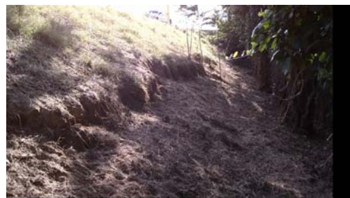
Close up of Scar at Levee Toe – photo 2