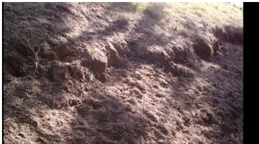
Close up of Scar at Levee Toe – photo 1